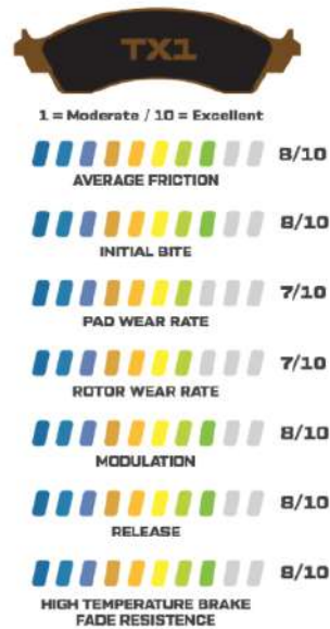
TX1 Performance Stats